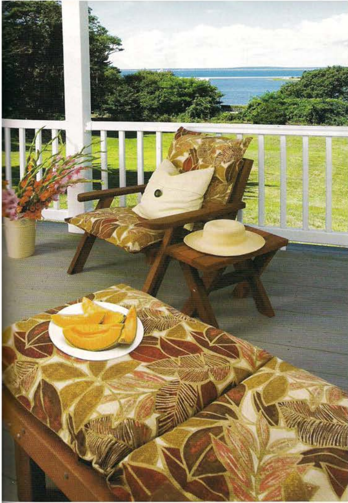
Top, left: A shaded spot on the lower level deck is the homeowners' favorite; right: This view of the home's front shows off the low maintenance perennial garden and new three car garage.