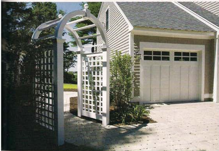
Lower, left: A new arbor leads to a courtyard patio area with an inlaid sundial; right: A gas fireplace, added to the master bedroom, offers a comfy reading spot.